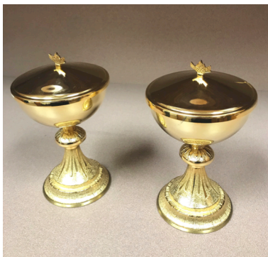
Ciborium (plural is ciboria )