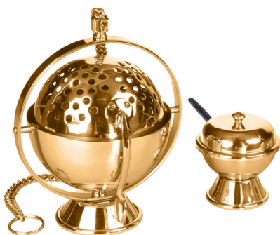
Thurible & Incense Boat