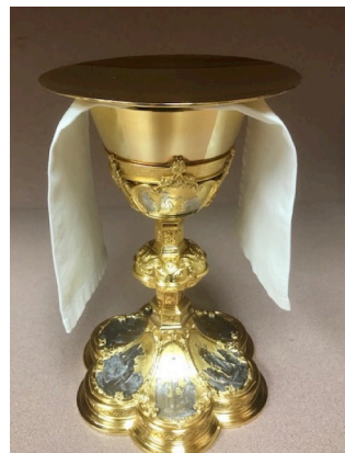
Chalice with Paten